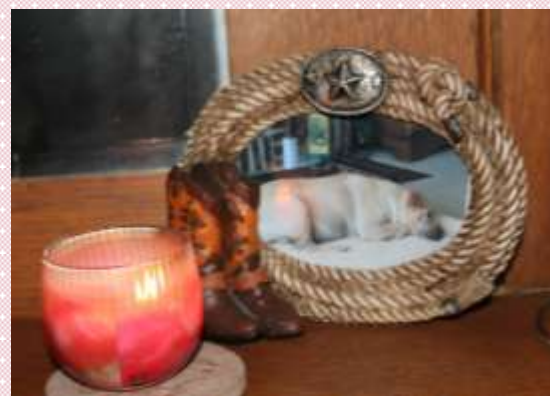
Pictures sent from the candle lighting ceremony for the 23rd anniversary Alize, Bumpus and Emma in memory